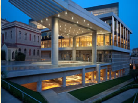
The New Acropolis Museum